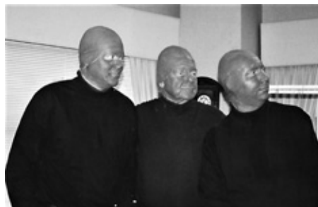
The Blue Man Group

in 1976 to form the Mission Inn Foundation and save the Mission Inn, service to the University of California Riverside, and numerous other civic awards recognizing his contributions over the decades.