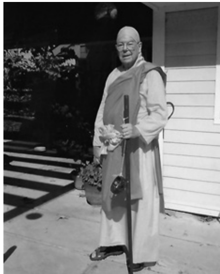
The Dalai Lama